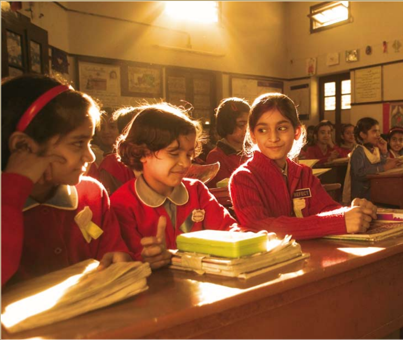
Sharing lessons and lasting friendships at St Teresa's School in Rawalpindi, PAKISTAN