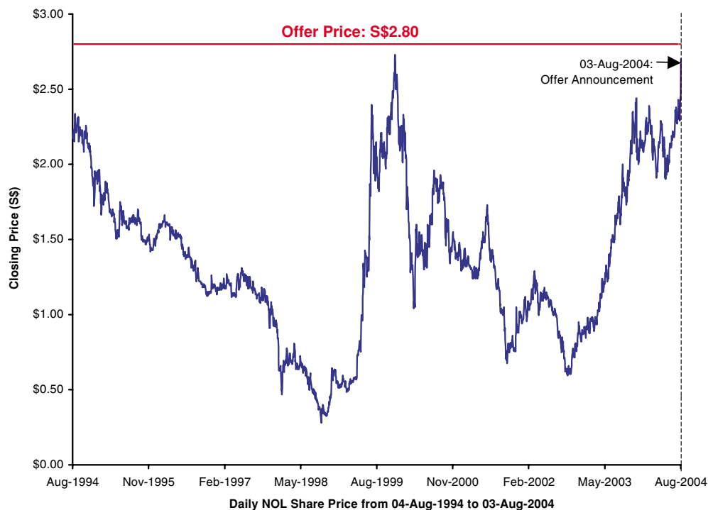
Ten-year Period Up to Offer Announcement Date

11.2 Historical Share Prices. The Offer Price exceeds the highest closing price of the Shares during the period from 4 January 1994 up till the Offer Announcement Date. Please refer to the charts below giving an overview of the historical Share prices over a ten-year period up to and including the Offer Announcement Date (between 4 August 1994 and 3 August 2004) and a six-month period up to and including the Offer Announcement Date (between 4 February 2004 and 3 August 2004).